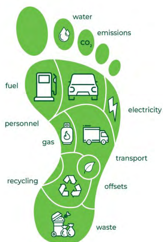
The Carbon Footprint