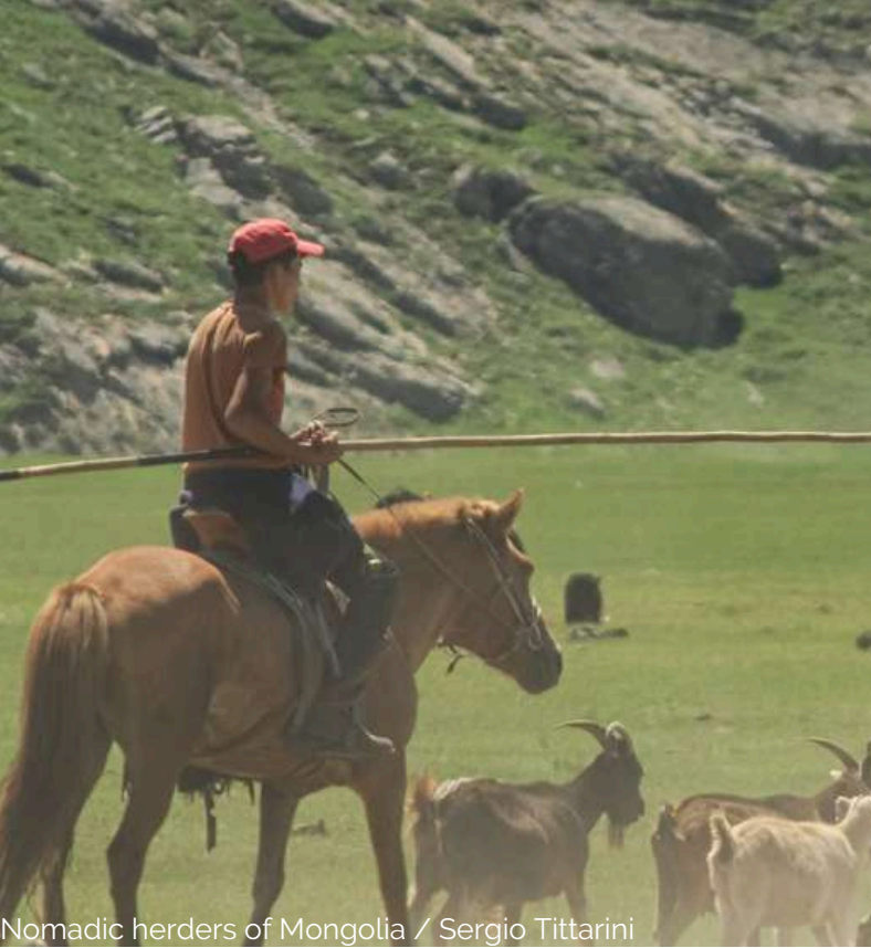
Nomadic herders of Mongolia