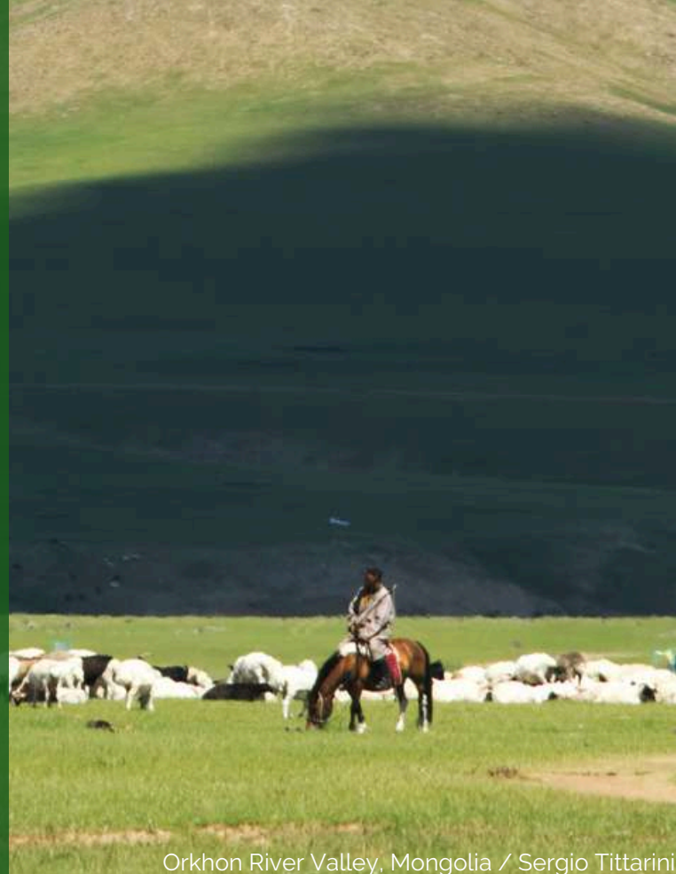
Orkhon River Valley, Mongolia

The ICOMOS World Heritage Transhumance Initiative is pleased to announce the opening of the call for poster contributions for the expert conference on Transhumance heritage taking place on 21-22 May 2024 in Baku, Azerbaijan.