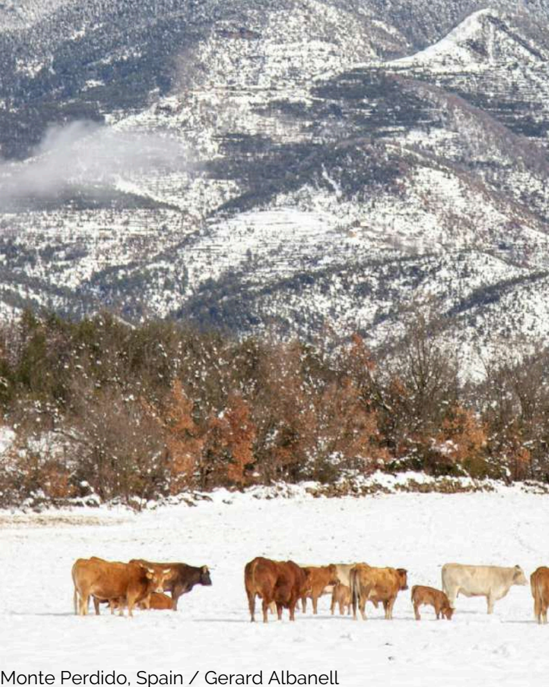
Monte Perdido, Spain / Gerard Albanell