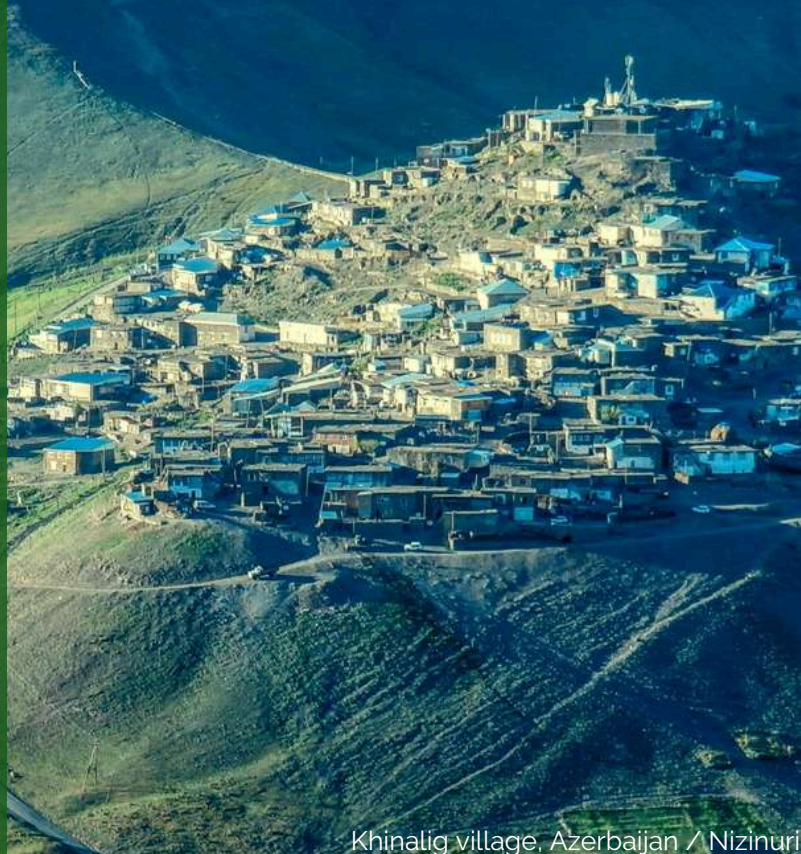
Khinalig village, Azerbaijan / Nizini