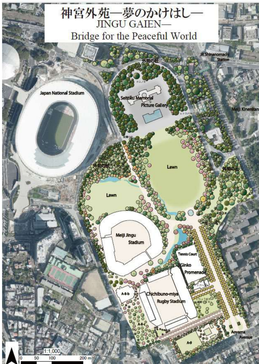
Fig. 2 – Alternative Proposal by ICOMOS Japan: Jingu Gaien--A bridge for the Peaceful World Created by Laboratory of Green Infrastructure in Research and Development Initiative, Chuo University.