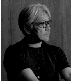
Musician, Ryuichi Sakamoto 2013