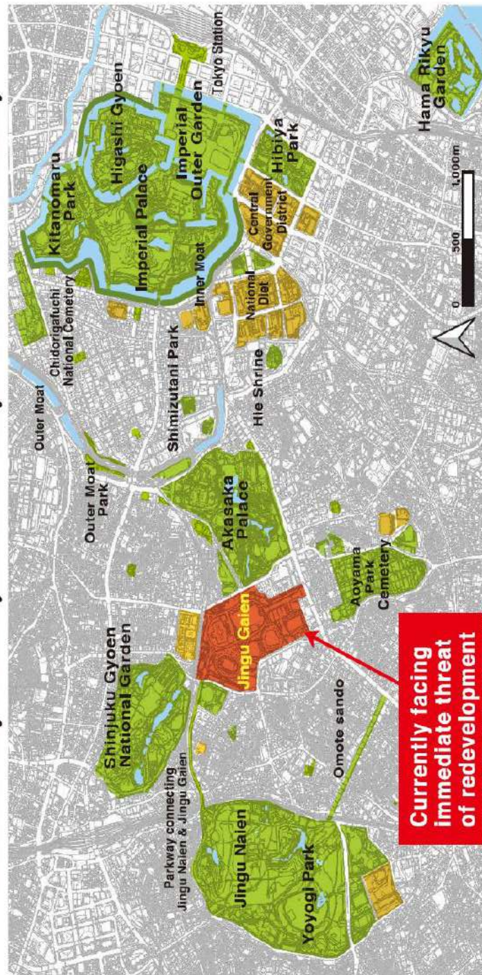
Fig.1 - Jingu Gaien, the core of the Garden City Park System, facing immediate threat by urban redevelopment

Created by Laboratory of Green Infrastructure in Research and Development Initiative, Chuo University. Graphics by graphic designers Noriko & Isao Tsunoi.